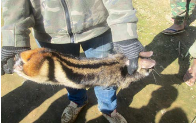
Snared Annamite striped rabbit, south-eastern Laos

This level of snaring has decimated ground-dwelling mammal and bird species, causing what biologist Kent Redford termed “empty forest syndrome”: habitat that is structurally intact but devoid of larger terrestrial mammals and birds. Several charismatic species have already been extirpated from the Annamites: tiger, rhinos, and leopard are now ghosts of the past. A few Annamite endemics, including the near-mythical saola , are now facing imminent extinction. This depressing state of affairs begs the question: How is the Annamite striped rabbit faring under such intensive poaching pressure? Until recently, scientists had little information on the species status. We needed data to find out.