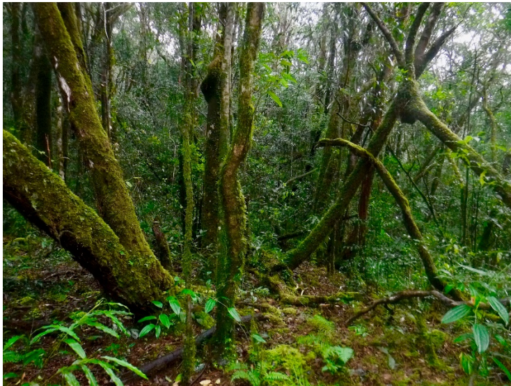
Annamites rainforest, south-eastern Laos

Finally, we need the political will to enact real changes on the ground in Vietnam and Laos. Unless higher-level government officials care about snaring and the plight of threatened Annamites species, it will be difficult to see change at the lower levels of protected area management.