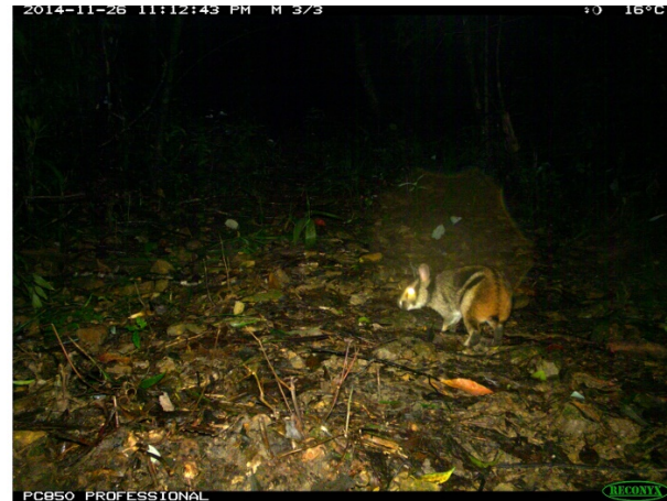
Annamite striped rabbit camera trap photos from Bach Ma National Park ( left) and the Hue Saola Nature Reserve ( right), both in Vietnam

What do we make of this information? It seems obvious that Annamite striped populations have declined significantly from historic levels in these sites. That in itself isn't surprising, since all ground-dwelling species in the Annamites have been hit hard by snaring, but the overall rarity of the striped rabbit is nonetheless cause for concern. The most jarring finding from our surveys was the fact that the striped rabbit is almost gone in our first survey site – another victim of relentless snaring. To me, the situation in this particular protected area represents a small part of a larger pattern that is playing out across the Annamites: Industrial-level snaring is causing local populations to blink out one by one, and this process is cumulatively driving species into total extinction.