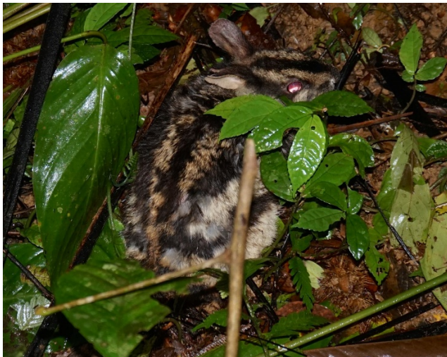
Annamite striped rabbit

The dense rainforests of the Annamite mountain range on the border of Vietnam and Laos harbors one of the highest concentrations of endemic mammal species found anywhere on a continental setting. Remarkably, several of these species were only recently discovered by science. The Annamite striped rabbit became known to the outside world in 1995 when a British naturalist discovered unusual-looking skins in a local market in Laos. Although the specimens resembled the Sumatran striped rabbit ( Nesolagus netcheri ), they were different from their Indonesian cousin. In 2000, following morphological and genetic analysis, the species was formally described as a new species, with the name Nesolagus timminsi honoring the naturalist who discovered it.