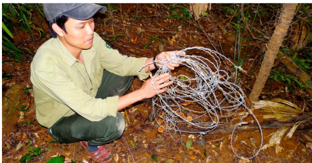
Snares in central Vietnam

Poaching casts a dark shadow over the incredible biodiversity of the Annamites. Poaching in Vietnam and Laos is primarily accomplished by the setting of wire snares. Snares are cheap and easy to set. All you need is wire cable – which can be picked up in any corner store for pennies – a long flexible stick, and a makeshift trigger mechanism. Attach the wire, set the trigger, bend the rod, and you're done. Any animal that steps onto the trigger will set off the trap and – snap! – the wire noose tightens and the pole springs upright. There is one less wild pig or civet or Annamite striped rabbit in the world.